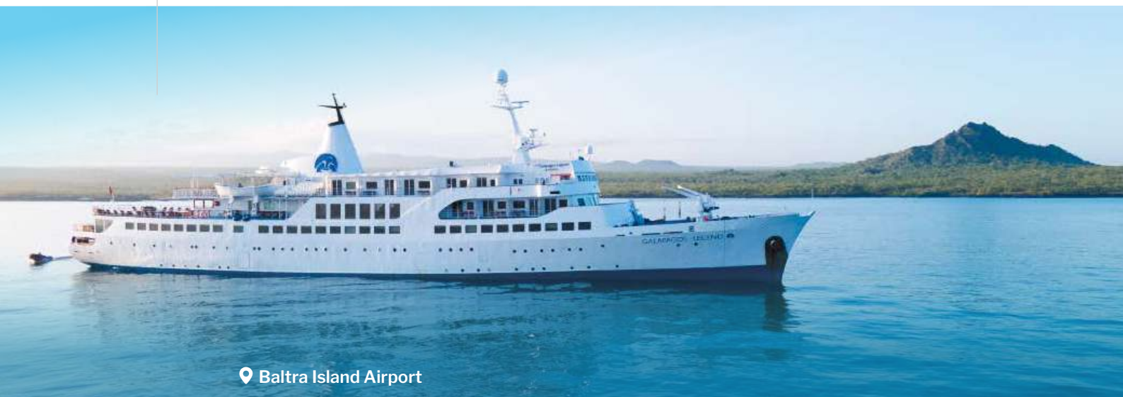
📍 Baltra Island Airport

Duration 1 ½ hour walk 45 min Panga ride 45 minute snorkeling