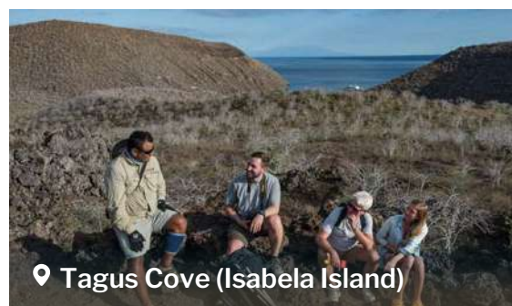
📍 Tagus Cove (Isabela Island)

Tagus Cove, a historic pirate hideout and anchorage. Visited by Charles Darwin and the HMS Beagle in 1835. Hike past Darwin Lake and stunning volcanic landscape, revealing Isabela island's dramatic northern volcanoes. Snorkel along a submerged wall with turtles, fish, penguins, and flightless cormorants. Enjoy a panga ride or kayak for added excitement!