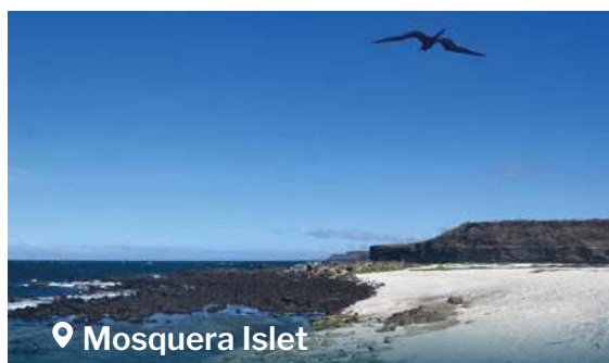
📍 Mosquera Islet

This tiny, low-lying islet, converted into coral sand, is set between the north and south Seymour Islands. It's home to a group of sea lions that come to laze on the soft white sand, it's an excellent spot to observe shorebirds, herons, lava gulls, and boobies. Snorkeling or diving here, one can often see sharks, rays, and barracudas.