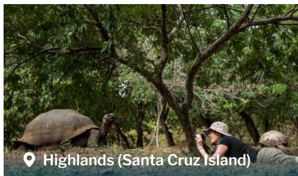
📍 Highlands (Santa Cruz Island)

In the central highlands of Santa Cruz Island, we have our best opportunity to interact at close quarters with totally wild, Galapagos giant tortoises. A short walk among these huge, 600lb, reptiles will also offer the chance for more highland species, especially several species of the famed finches.