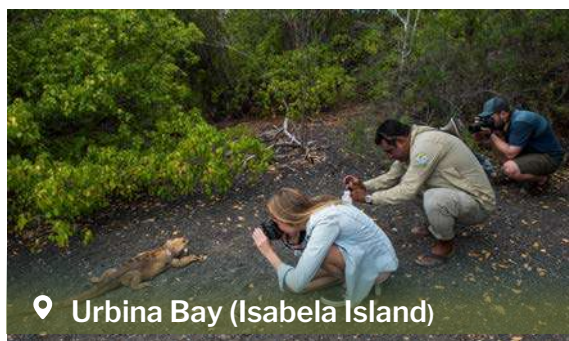
📍 Urbina Bay (Isabela Island)

At the far end of a long level hike, we arrive at a strange phenomenon where large blocks of coral lie completely exposed after a dramatic geological uplift in 1954. Located at the western base of Alcedo Volcano, we hope to run into a few impressive land iguanas and some volcanoes endemic to Galapagos giant tortoises during the wet season